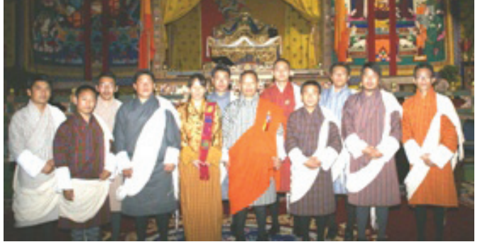
Participants with Hon'ble Speaker

At the conclusion of the programme, the participants met with the Hon Speaker of the National Assembly. The participants expressed that the attachment program was very useful and informative. The participants also met with the Secretary General of the National Assembly before leaving for their respective Dzongkhags.