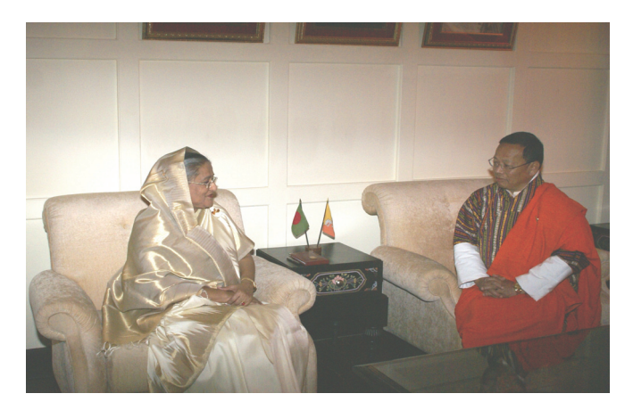
Hon Speaker Jigme Tshultim with Prime Minister Sheikh Hasina

Prime Minister Sheikh Hasina was accompanied by a high level delegation including the Foreign Minister, Commerce Minister and Industry Minister.