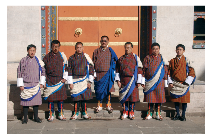
Legislative Committee Members with honourable Speaker and Dy. Speaker

The National Assembly passed the National Assembly Committee Act of Bhutan 2004, on July 30, 2004.