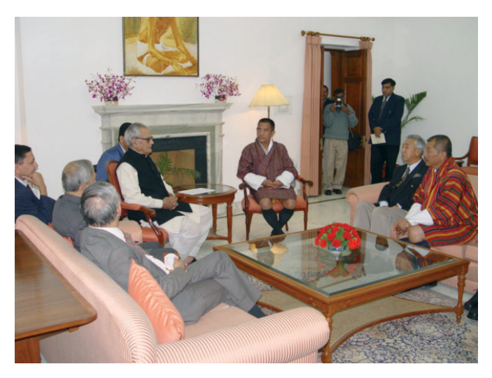
The Honourable Speaker with the Vice-President of India

On the side-line of the visit to Pakistan to attend the 5<sup>th</sup> General Assembly of AAPP, Dasho Ugen Dorje, Speaker of the National Assembly also accepted the invitation of the Government of India to visit New Delhi from 5<sup>th</sup> to 8<sup>th</sup> December 2004.