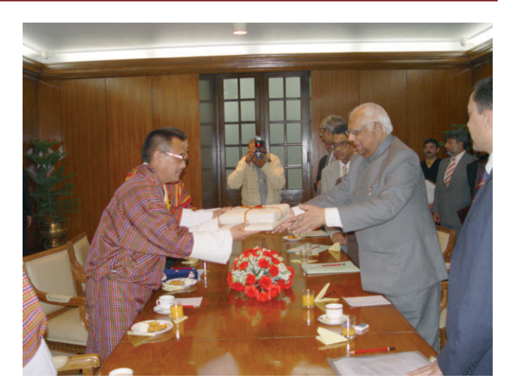
The Honourable Speaker with the Speaker of Lok Sabha

Besides the Call On to the Speaker, the Vice President and Chairman of Rajya Sabha and the election Commissioner of India and exchange of ideas and experiences with them, the Honourable Speaker and the delegates also met other senior officials of the Government of India during their stay.