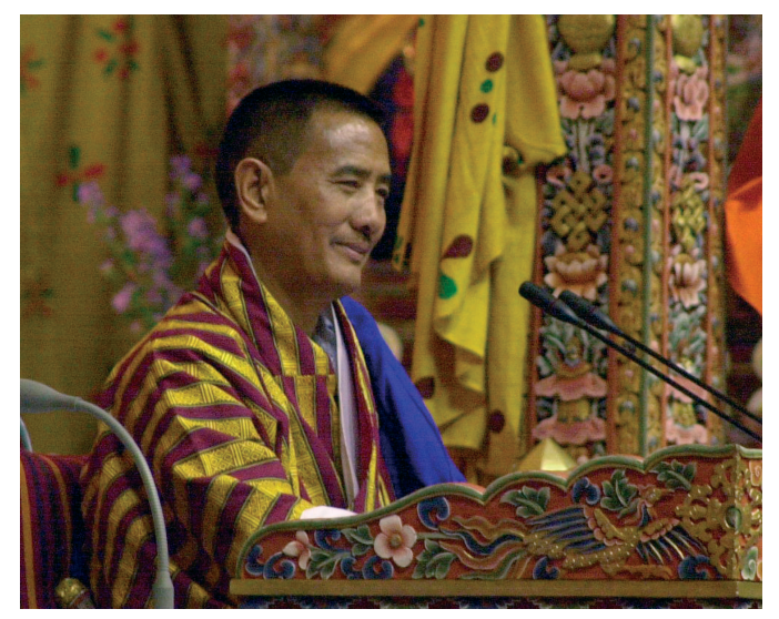
To commemorate the 31<sup>st</sup> Coronation Anniversary of His Majesty the King, the National Assembly of Bhutan has launched its official web-site on June 2, 2005.

The National Assembly of Bhutan website is designed to facilitate access by members of National Assembly, ministries, departments, organisation and the general public to information on legislations, publications, activities and about the Secretariat. While resolutions from the 76<sup>th</sup> to the 82<sup>nd</sup> sessions are included in the web-site, it is envisaged to make all the resolutions available on the web in the second phase.