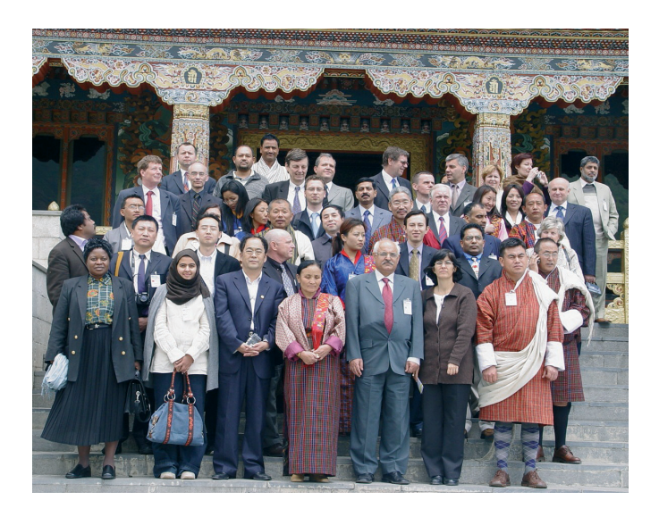
INTOSAI - International Organization of Supreme Audit Institutions delegates visit the National Assembly

The Secretary and the senior officials of the National Assembly Secretariat welcomed the 52 member INTOSAI delegates to the National Assembly on April 28, 2005. This was the biggest group that visited the National Assembly so far. Besides organzing an orientation programme for the delegates to create awareness on the functions, roles and responsibilities of the National Assembly, the Tshogdu documentary film was also screeened. Before their departure, the delegates visited the visited the National Assembly Hall.