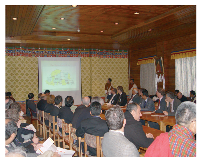
Mission to assess possible support to the National Assembly

The Secretary and the senior officials of the National Assembly Secretariat welcomed the 52 member INTOSAI delegates to the National Assembly on April 28, 2005. This was the biggest group that visited the National Assembly so far. Besides organzing an orientation programme for the delegates to create awareness on the functions, roles and responsibilities of the National Assembly, the Tshogdu documentary film was also screeened. Before their departure, the delegates visited the visited the National Assembly Hall.