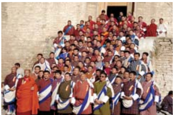
Members at Semtokha Dzong

The Venerable Dorji Lopen of Zhung Dratshang and Hon'ble Lyonpo Jigme Y. Thinley, Minister for Home and Cultural Affairs were also present during the visit.