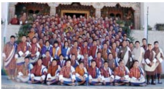
National Assembly Members with His Majesty the Fifth Druk Gyalpo, Jigme Khesar Namgyel Wangchuck

The Speaker informed the House that the 1949 Friendship Treaty between Bhutan and India has been reviewed and updated by the two Governments to reflect the contemporary nature of our close relationship and to provide a strong foundation for the continued growth of this excellent relationship in the 21 st century.