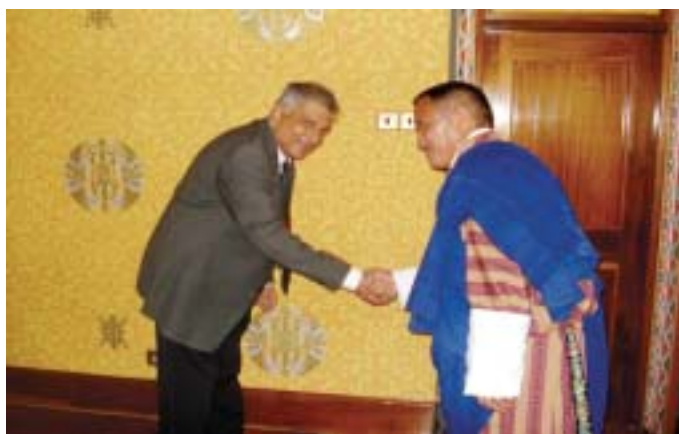
H.E. Mr. Ranil Wickramasinghe with Hon'ble Speaker

The Call on concluded with the tour of National Assembly Hall