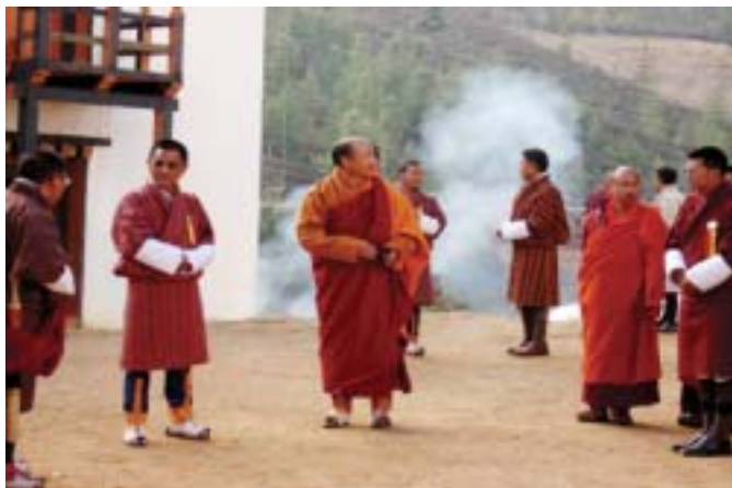
Members at Nyinzerang Lhakhang