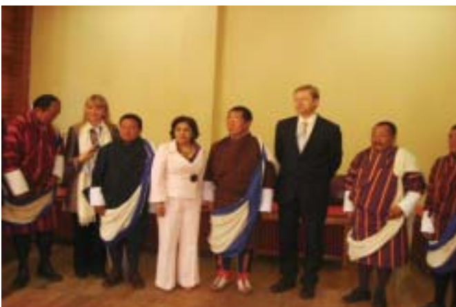
Dy. Speaker with delegates from European Parliament

A 9-member Delegation from European Parliament led by Ms. Neena Gill, Chair of the Committee of Budgets, PSE, UK called on the Deputy Speaker of the National Assembly on March 19, 2007 in the National Assembly Conference Hall. The delegation team showed keen interest to learn about the political transition that our country was going to experience with the introduction of a new constitution and a democratic parliamentary system. The members also enquired about the steps taken by the government for fair representation of people from different regions of the country both in the current National Assembly and for the new Parliamentary System.