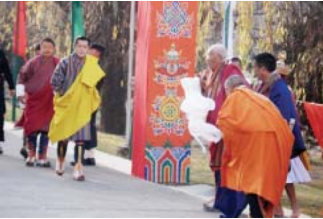
His Majesty received by National Assembly members to the 86th session

The 86 th Session of the National Assembly began on the auspicious Second day of the 11 th Month of Bhutanese Calendar (Male Fire Dog Year) corresponding to December 22, 2006 amidst traditional ceremonies. His Majesty the Fifth Druk Gyalpo, Jigme Khesar Namgyel Wangchuck graced the opening ceremony of the session. His Majesty was received by the members and escorted to the Assembly Hall in an elaborate Chipdrel procession for the traditional Marchang and Zhugdrel ceremonies.