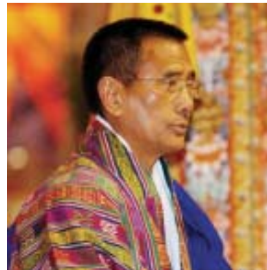
Hon'ble Speaker addressing the opening ceremony

The Speaker also congratulated all the new and re-elected Assembly members and reminded them that they are chosen with full trust and confidence by the people. He expressed hope that members will engage in substantive deliberation, keeping in mind the laws of the Country and for the welfare of the entire Bhutanese people.