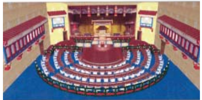
Proposed drawings of the National Assembly Hall