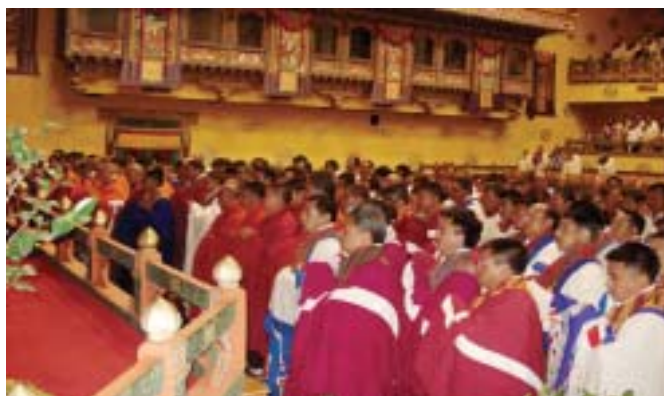
Members at the Tashi Moenlam

prosperity in the country, and happiness of the Bhutanese people.