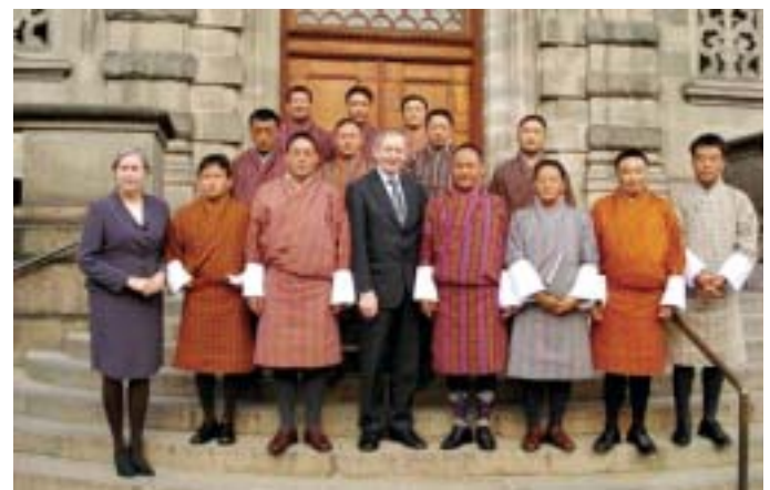
Bhutanese Parliamentary delegation with H.E. Mr. Christain Mejdahl, Speaker of the Danish Parliament.