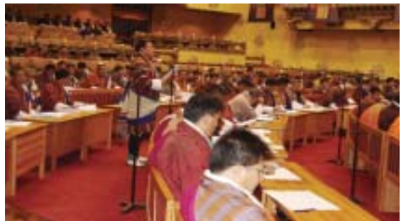
PAC Chairman presents Physical Verification Report

The main focus of deliberation was on the issues related to development activities which embodied 12 important issues. Under miscellaneous issues, it included a total of 28 points which were all pertinent issues having direct bearing on the socio-economic development and good governance. Besides the deliberations, 3 new Acts were also enacted. They include: