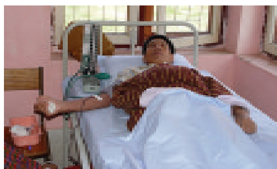
NA Member Donates Blood