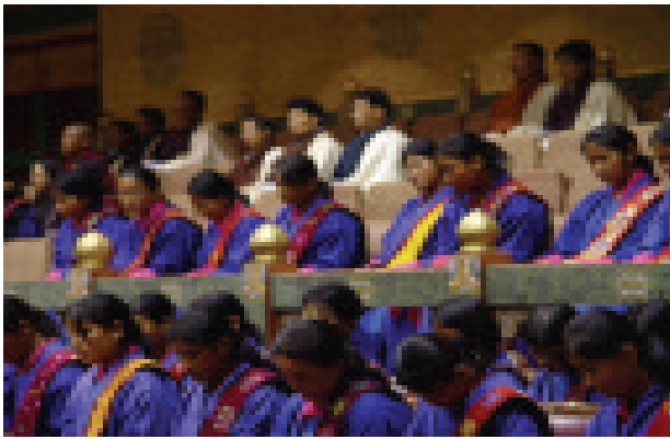
Students Observing House in Session