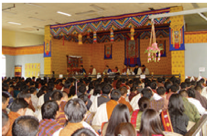
Graduates Of 2005

The hon'ble Speaker, Dasho Ugen Dorje accompanied by the Deputy Speaker and officials from the National Assembly Secretariat addressed the graduates attending the National Graduate Orientation Programme 2005 on August 30, 2005 at the Youth Centre. The Hon'ble Speaker briefed the graduates on the National Assembly and the many legislative reforms taking place in the legislature. There were 664 Graduates attending the National Orientation Programme - 2005.