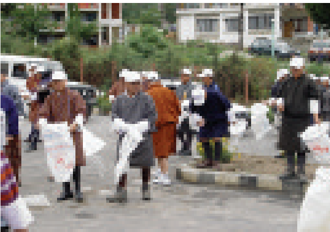
NA Members at Work