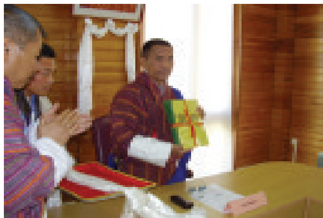
Hon'ble Speaker launched ODS