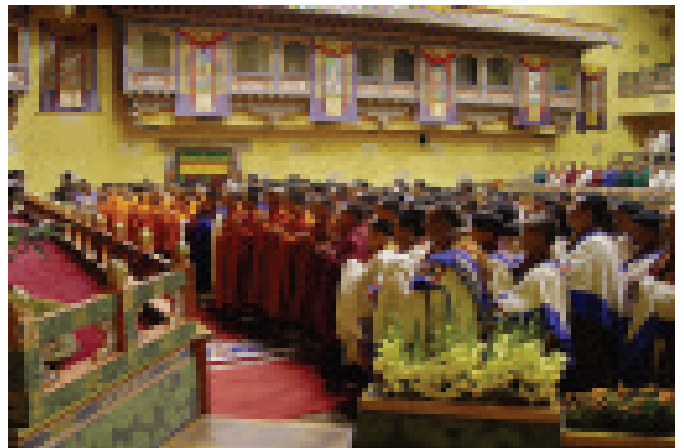
NA Members offering "TASHI MOENLAM"

The National Assembly offered prayers for all the sentient beings to be saved from disease, epidemics, wars and natural calamities. The members wished that the precious teachings of Lord Buddha, a source of well being for mankind, continued to flourish. They offered prayers for the long life of His Majesty the King and happiness of the Bhutanese people. The 83 rd Session of the National Assembly concluded on the 16 th day of the 5 th month of the Wood Bird Year corresponding to June 23, 2005 with fervent hope for a happy union in front of the golden throne in the next Session.