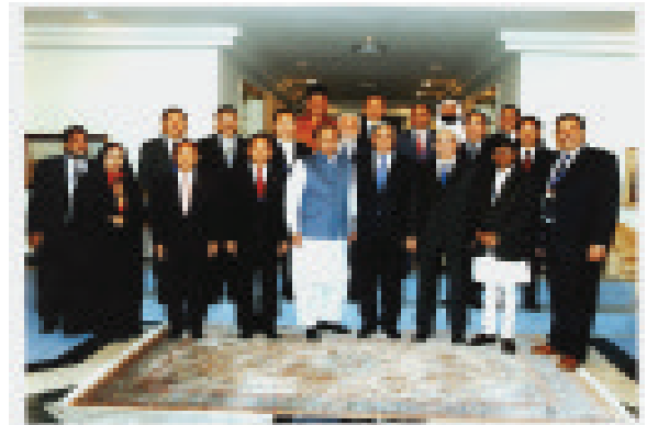
AAPP in Islamabad, Pakistan

Kingdom of Thailand. The theme of the Conference is 'Peace, Democracy and Solidarity' while the topics for discussion are Political, Socio-Economics, Peace and Security and Women and Youths.