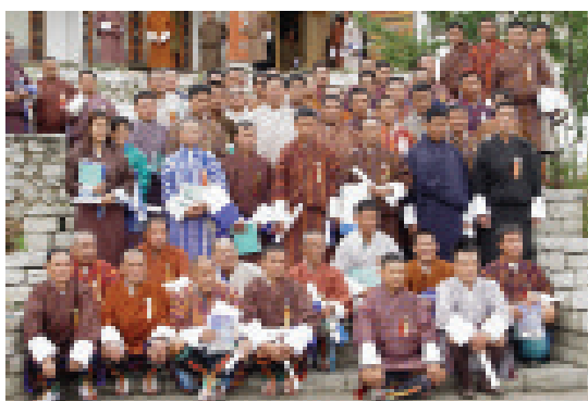
NA Member at Showcase

The hon'ble Minister of Information and Communication presided over the E-Governance Showcasing.